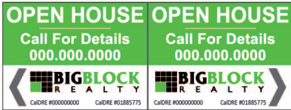
24" w x 18" h Double-Sided Sign