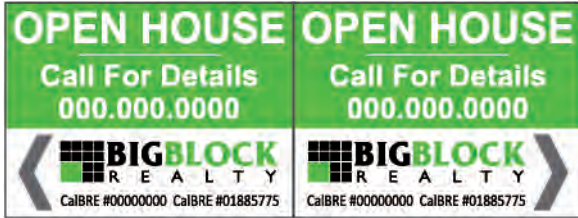
24" w x 18" h Double-Sided Sign